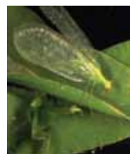
Frank Peairs, Colorado State, Bugwood.org

Green Lacewing larvae voraciously eat insect pest eggs and larvae, including aphids, red mites, thrips, whitefly, leafhoppers, and mealybugs. Larvae eat for 2-3 weeks, spin a cocoon, and 10-14 days later, emerge as adults (which eat only nectar and pollen).