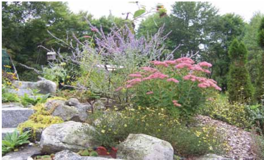
Drought tolerant rock garden.

This is truly the key to success. Plants have evolved to live in certain conditions. Trying to make a shade-loving plant grow in a spot that gets four hours of direct sunlight makes for an unhappy plant. Select low-maintenance,