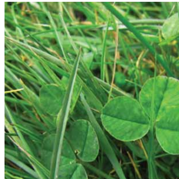
Clover adds nitrogen to your soil

Dutch white clover is a beautiful low-growing, broadleaf species that used to be a welcome addition to many lawns. This hardy perennial smothers weeds, prevents erosion, retains moisture and naturally "fixes" nitrogen in your soil. Clover is tough enough to withstand foot traffic and offers beautiful dark green foliage and small white flowers. If bees are a concern to your family, control the blooms with frequent mowing.