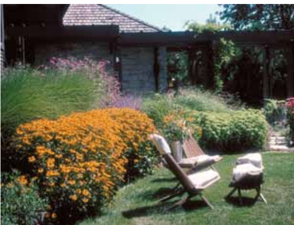
A beautiful and functional Greenscape with low-maintenance plants full of color and interest framing the lawn's recreational area.

By spending 5% of the value of your home on the installation of a quality low-maintenance landscape, you can boost the resale value of your property by 15%, earning back 150% or more of your landscape investment (source: Smart Money)